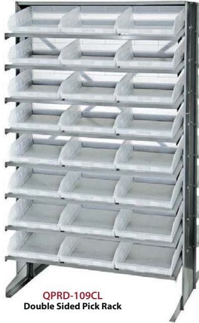
QPRD-109CL Double Sided Pick Rack