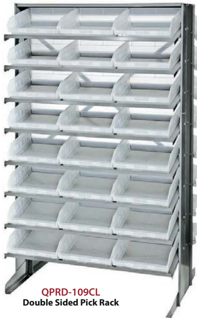
QPRD-109CL Double Sided Pick Rack